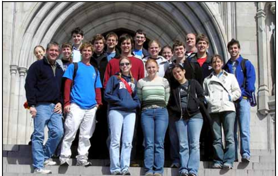
Newman Center students and staff at St. Patrick's Catholic Cathedral in Armagh, Northern Ireland

Leaving Dublin, the group visited Glendalough, the medieval monastery built by St. Kevin; St Brigid's Monastery in County Kildare, with its famous round tower; the Hill of Tara, best known as the seat of the High Kings of Ireland; the Hill of